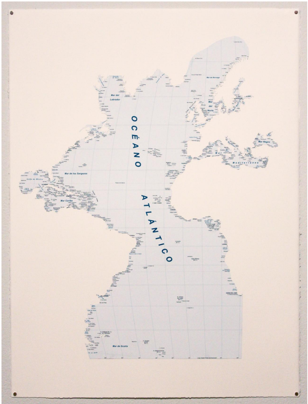
Irene Pérez Untitled (el Charco)II, 2010 collage on watercolor paper 2010