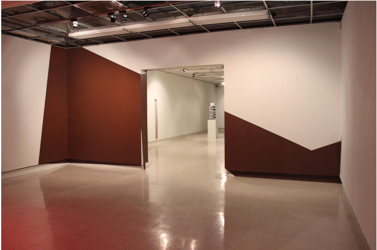
Maria Gaspar Brown Out latex paint on wall 2010